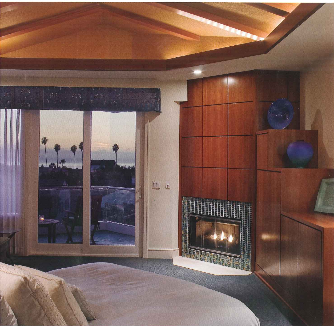
Above: Jeanine's favorite time of day is dusk—from the master bedroom, she can soak up amazing sunsets.